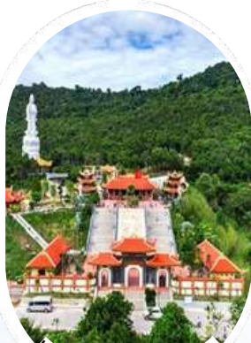
Ho Quoc Pagoda

Flight suggested : AK545 KUL PQC 12:50 13:55 ( excluded in our prices)