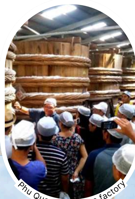
Phu Quoc fish sauce factory